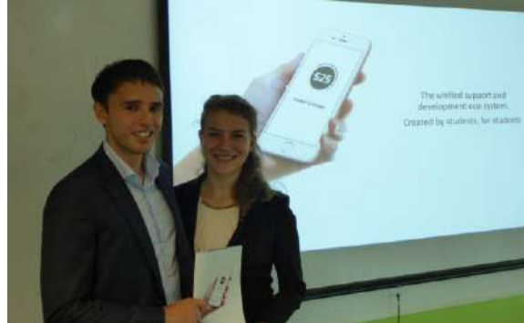
Bright Ideas Den