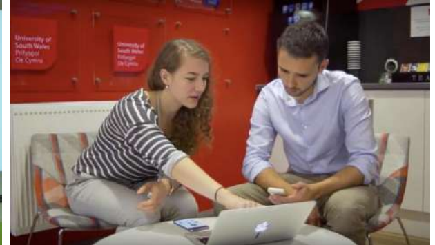
USW Exchange & Business School